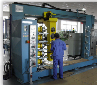
Cylinder CNC Winding Machine