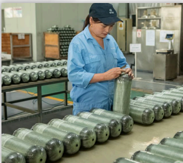
Quality Control Inspection