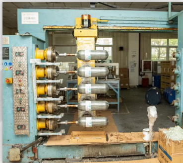
Epoxy Application System