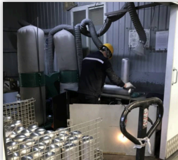
Cylinder Shell Inspection